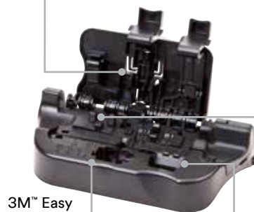
3M™ Easy Cleaver