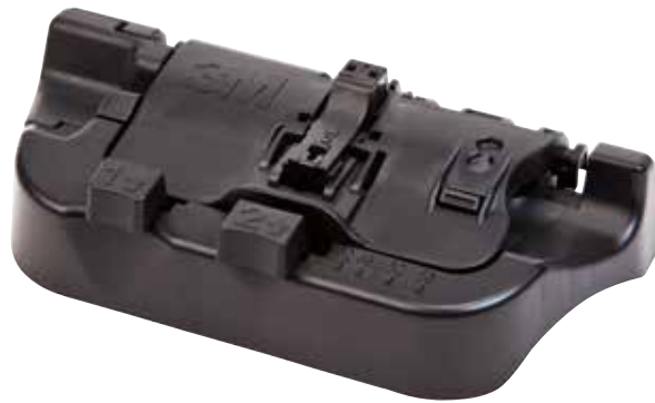
3M™ Easy Cleaver

*3M Easy Cleaver is included in select packages of 3M connectors and splices for a nominal increase in price. Use of the 3M Easy Cleaver with other manufacturers' connectors is not recommended and may void the warranty.