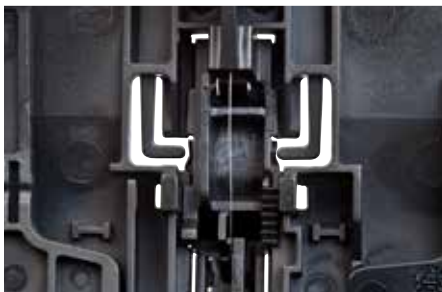
Diamond wire shuttle