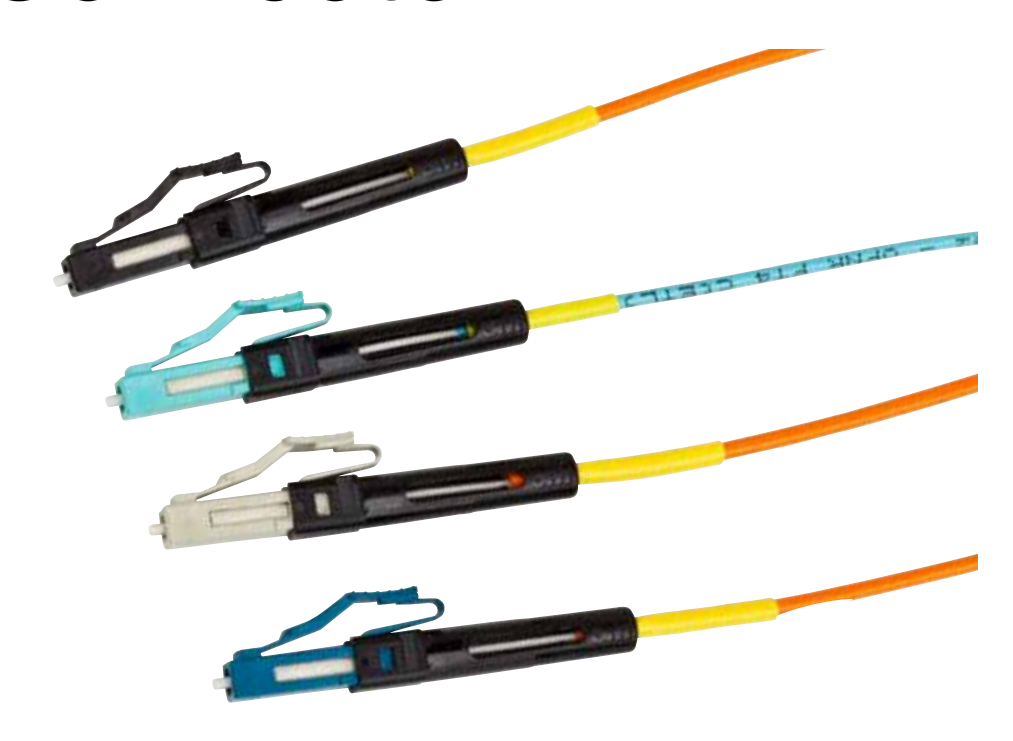
3M™ No Polish Jacketed LC/UPC Connector Family

3M™ No Polish Jacketed Connectors are RoHS compliant.*