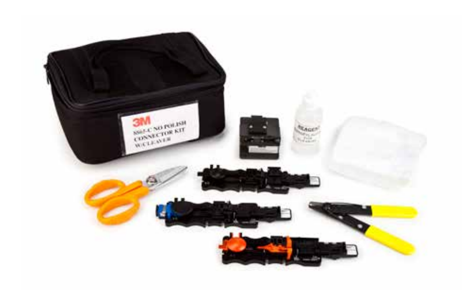
The 3\mbox{M}^{\mbox{\tiny $\infty$}} No Polish Connector Kit with Cleaver 8865-C includes all the tools necessary for termination