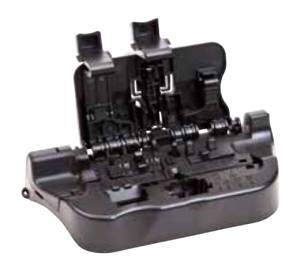
3M<sup>™</sup> Easy Cleaver is conveniently included in select packages of 3M<sup>™</sup> No Polish Jacketed LC/UPC Connectors